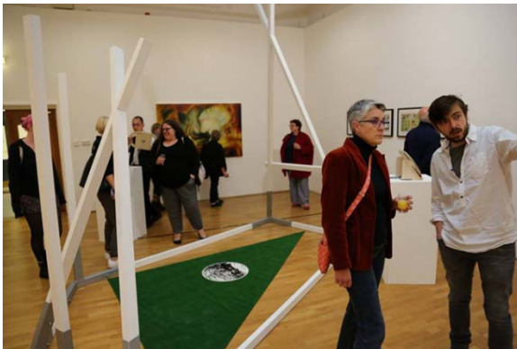
Figure 2. CMSII (2017) Oriel Sycharth Gallery, Wrexham.

The following three contributors to CMSII have been selected as examples to demonstrate how the Show-Talk-Do model can be applied in practice.