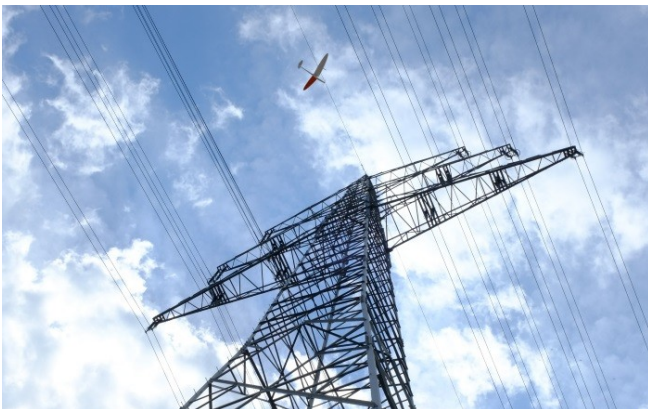
Fig. 5. Delair Tech BVLOS for power line inspection applications [29].

This may sound as though the problem that was once facing the drone industry has been solved, however the use of AI itself presents problems of its own. AI itself is a controversial topic for both industry and politics. Keeping AI, or narrow AI, which is purely focused on autonomous drone navigation, at a level that is beneficial for the good of mankind is hotly debated and motivates many research areas although flight safety is always the key element to be