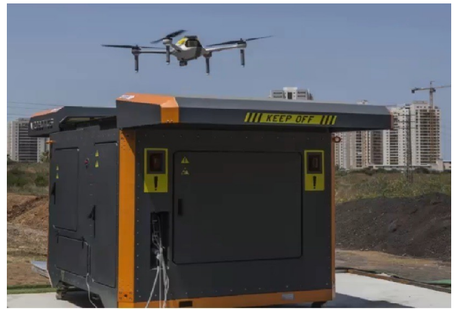
Fig. 6. Airobotics autonomous BVLOS system [33].

considered. The goal for most research is to create general AI that far outgrows the relative conformity of narrow AI [31]. Currently the AI that we are living with are neural networks and machine learning algorithms that are used in everyday common devices [31]. A main concern is for our own preservation as it is feared that AI could at some point become intelligent enough to replace humans and become part of a technological singularity. Indeed this is a situation some may even welcome as they see AI as a panacea for civilisation [32] even though AI might outperform humans at every cognitive task and risks rendering us obsolete [31]. AI will undoubtedly have a major impact on people's lives, but the benefits are undeniable.