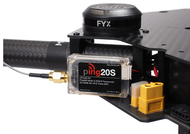
Fig. 3. Ping20s transponder [17].

There is also an obvious need for a UAV to be aware of its surroundings and aware of other air traffic by using detect and avoid technology. One such technology has been developed and a paper published by Balachandran et al. [19]. The paper explores an approach that enables a multitude of aircraft to coordinate their own manoeuvres. This is achieved by each of the aircraft implicitly agreeing on the region of the airspace that they will be occupying at that time. This in turn has led to the construction of a feedback mechanism that can be executed in real time. The planning of this process assumes that all the aircraft will reside in their own region and it is this assumption that is crucial to ensure that no aircraft are able to occupy the same airspace. Information is shared between the aircraft in relation to when one aircraft speeds up or slows down and will then assess the likelihood of a collision. If an aircraft enters an adjacent zone occupied by another aircraft it will be required to enter a holding pattern until it decides that it is safe to proceed it is therefore much more suited to multirotor UAV's than fixed wing craft. This decision-making ability can also serve as a feedback mechanism. The conclusion raised in the paper states that the best