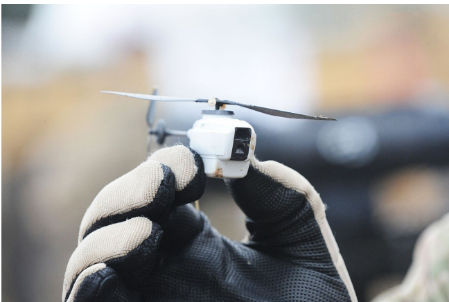
Fig. 7. Black Hornet Nano [38].

The use of video capturing sensors is a multi-faceted problem, as with any broadcast a reliable transmission signal is a must. As the wireless communication link must