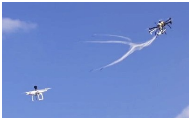
Fig. 4. Foretem DroneHunter in action [23].

This software provides the operator and autopilots with complete situational awareness, detect and avoid system. By gathering data from various sources such as aviation transponders, ground based radar pulses and air traffic warnings. Vigilant Aerospace also incorporated an exclusive NASA patent software, which forms the backbone of the FlightHorizon product. The invention and patent by Arteaga [28] which is basically an ADS-B system details that traffic information will be included in the transmission and through telemetry communication that is transmitted to a remote ground system. The invention goes