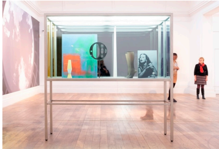
Figure 1. Josephine Meckseper. The Story of Mankind , 2014 (Installation). Mixed media in stainless steel and glass vitrine with fluorescent light and acrylic sheeting.

Meckseper's work (e.g., Figure 1) combines paintings and found objects with her own images and film footage of political protest movements. Her installations and vitrines 'by simultaneously exposing and encasing common signifiers, such as advertisements and everyday objects, next to abstract paintings and sculptures create a window into the collective unconscious of our time.' (Cramerotti 2018). She uses digital media as a tool of production, exhibition and for her films, distribution, to rearrange and interrupt the contextual settings we associate with her found objects and images.