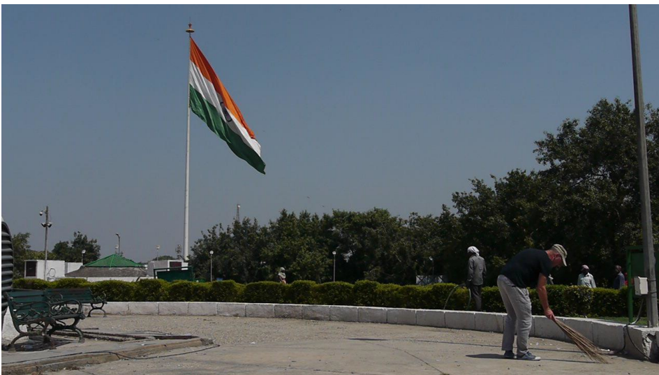
Figure 7. Alec Shepley 2014 Enactment #3 Palika Park, New Delhi