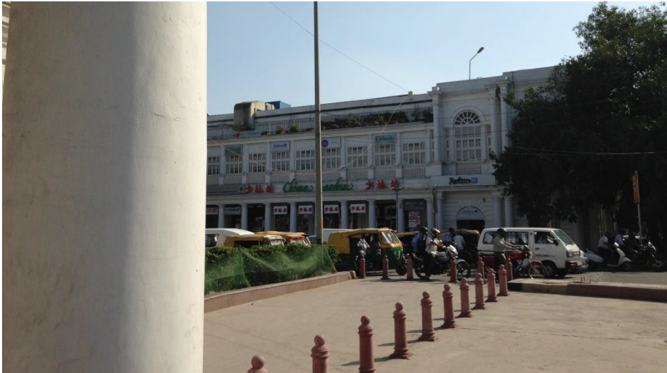
Figure 4. Connaught Place, New Delhi