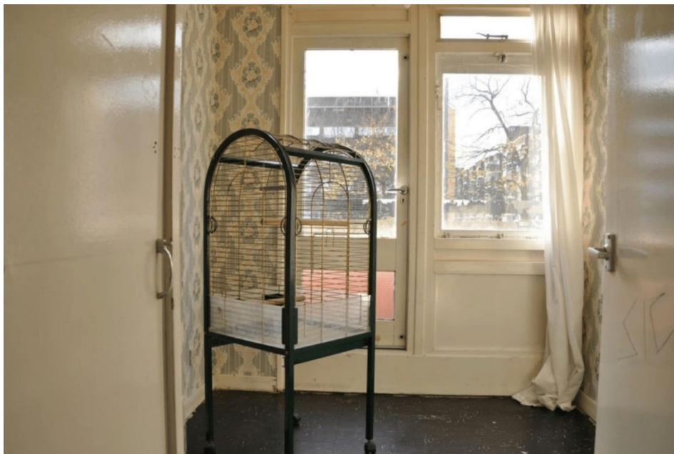
Figure 5: Llafarganu Papagei , photograph of installation, Shelmerdine Close, East London, UK

The twenty-minute looped audio commenced with a quiet two-minute solo recital. This monologue was repeated until midway through a second voice melded with the first. As the piece progressed, the two additional female voices joined the collective, all with different regional accents, which depicted the diversity of the local population. As the voices increased, they clamoured for attention until reaching a crescendo and then, slowly finding their own rhythm, they reduced to a single monologue once again. The sound seeped through small speakers situated around the perimeters of the room. Within this audio installation, just as in my 'dream films', the piece was as much about sounds, textures, colours and compositions as about social commitments.