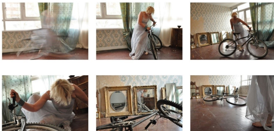
Figure 4: Cycle , photographs of performance (author), Shelmerdine Close, London, UK

The two selected camera viewpoints (one situated on the dressing table and the other facing the window) as presented in the film Cycle eventually became intertwined in the editing process 7 . For an instant I appeared to transcend and then multiply, becoming one with the maisonette's interior, exploring existence and objects through time and space. Francesca Woodman's photographic gelatin silver prints from the House series (1975-1976) influenced the aesthetics of my project, for example through the layering of a female body, blurred by movement and long exposure (Lomas 2009). Although in Cycle the film's varying viewpoints are in colour and record the sequence of movements. On the relationship of the viewer with the actor or action in conventional film, Gravity 7 notes "the signifying production of moving image and sound would have to peel off the printed page to unravel on the cutting room floor, awaiting new modes of reconstruction and assemblage" (Chan 2007).