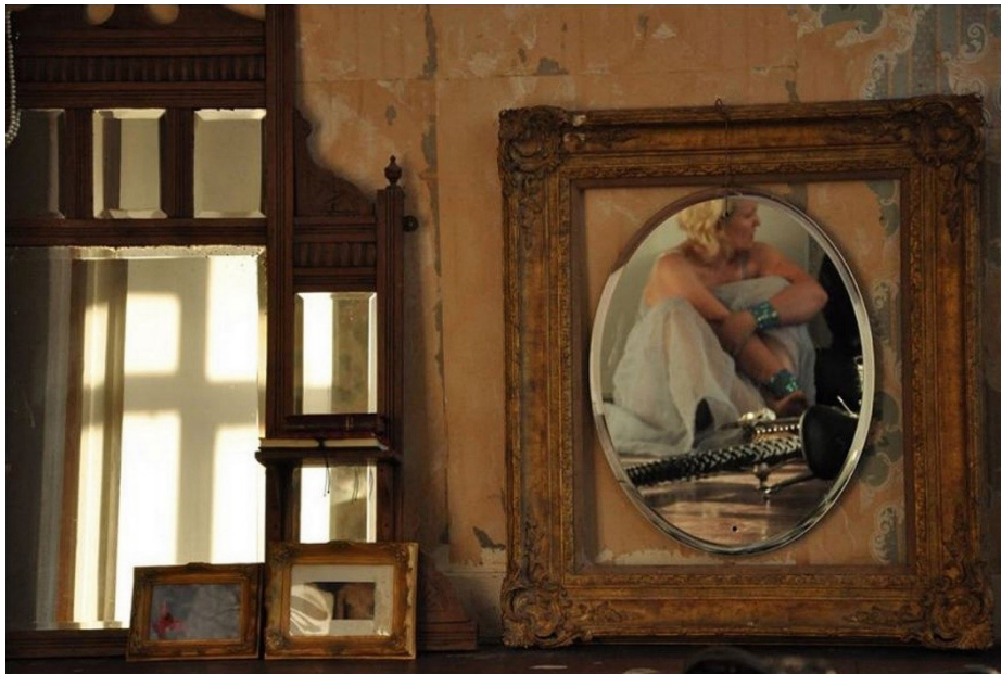
Figure 3: Cycle , photograph of performance, Shelmerdine Close, East London, UK

The two selected camera viewpoints (one situated on the dressing table and the other facing the window) as presented in the film Cycle eventually became intertwined in the editing process 7 . For an instant I appeared to transcend and then multiply, becoming one with the maisonette's interior, exploring existence and objects through time and space. Francesca Woodman's photographic gelatin silver prints from the House series (1975-1976) influenced the aesthetics of my project, for example through the layering of a female body, blurred by movement and long exposure (Lomas 2009). Although in Cycle the film's varying viewpoints are in colour and record the sequence of movements. On the relationship of the viewer with the actor or action in conventional film, Gravity 7 notes "the signifying production of moving image and sound would have to peel off the printed page to unravel on the cutting room floor, awaiting new modes of reconstruction and assemblage" (Chan 2007).