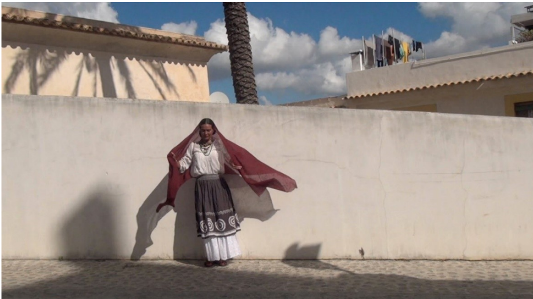
Figure 1: FRIDA Travels to Ibiza , film still of performance, Old Town, Ibiza, Spain

My practice synthesises the relationship between travel, art history, film and painting. This is especially significant in the FRIDAm Series (2017), an ongoing collaborative project with artist Sally Turner researching the life of Mexican artist Frida Kahlo. Turner and I first began collaborating in 2003; Turner working as a performance artist and myself as a fine art filmmaker. The title of FRIDAm was chosen as a play on the words ‘freedom’ and ‘Frida’, Kahlo’s first name. The focus was on Kahlo’s legacy, her approach to politics, women’s equality, overcoming disability and establishing herself as a painter. Exploring the concept of how Kahlo might react and respond to an evolving art scene, FRIDAm attempts to capture the essence of Kahlo’s spirit in a contemporary world. Working closely with Turner, who has a striking resemblance to Frida, has enabled a relationship to unfold, a rapport to evolve that transcribes through the films.