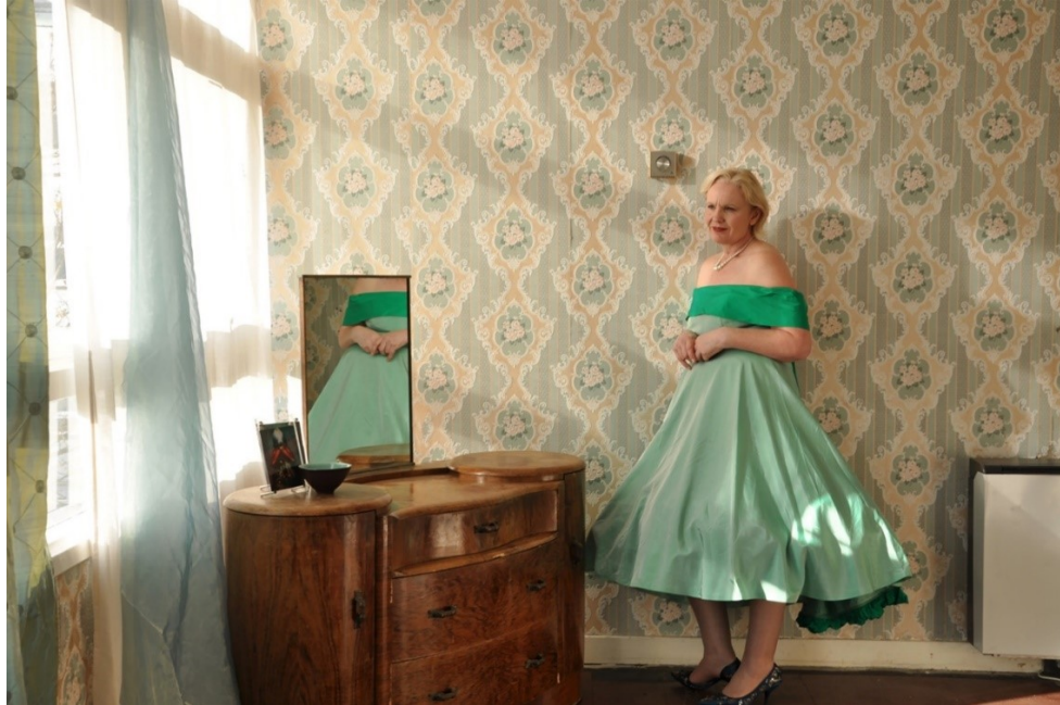
Figure 7: Frock , photograph of filmed performance / installation, Shelmerdine Close, East London, UK

universal but affected by the language we speak, our culture, environmental factors and our gender. Colour perception is also affected by sound as well as other colours and therefore audience durational perception of time can be influenced to slow or increase films tempo. The symbolism of colour in films can mean many seemingly contradictory concepts even within the same film, demonstrating the major contextual roles in its meaning.