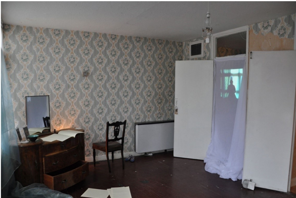
Figure 6: Frock , photograph of filmed performance / installation, Shelmerdine Close, East London, UK.

Space , Bachelard (1958) philosophically writes a lyrical exploration of the home, discussing outside and inside as forming “a dialectic of division, the obvious geometry of which blinds us as soon as we bring it into play in metaphorical domains”. Bachelard’s philosophical meditation on oneiric (dream) space was how creative thought comes into being. The authentic poetic image emerges from a form of forgetting or not-knowing that is not ignorance but a difficult transcendence of knowledge. The viewer, on looking more closely, could see the evidence of the pixels from the moving images resonating on the fabric, which intensified as the light faded. Half-way through the film I leisurely rotate 180 degrees turning to face the window. Here, great attention to detail was given, through mise-en-scène over experiments in editing and post-production special effects, referencing back to an earlier tableau created in Drift (Heald 2005) and André Bazin’s notion of ‘true continuity’ 11 . Bazin’s critical theory argued for objective reality and applauded in camera techniques as opposed to the film theory focus of the 1920s and 1930s on how cinema could manipulate reality (2004). The concentration on objective reality, deep focus, and absence of montage enabled the audience to draw upon their own interpretations of Frock .