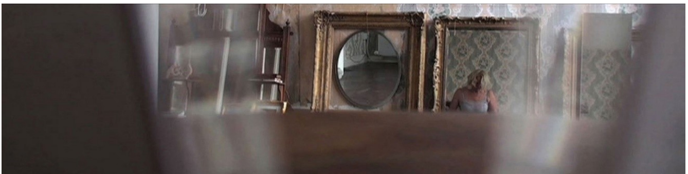
Figure 2: Cycle , film still 1 of performance, Sheldene Close, East London, UK

In Death 24x a Second: Stillness and the Moving Image Laura Mulvey's (2006) notion of the 'Pensive Spectator', argues that easy access to repetition, slow motion and the freeze-frame may well shift the spectator's pleasure to a fetishistic rather than a voyeuristic investment in the cinematic object. The manipulation of the cinematic image by the viewer also makes visible cinema's material and aesthetic attributes. By exploring how new technologies can give contemporary life to 'old' cinema, Death 24x a Second offers an original re-evaluation of film's history and also its historical usefulness.