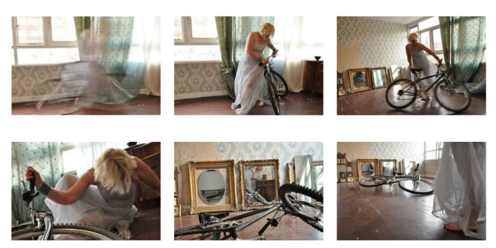
Figure 4: Cycle, photographs of performance (author), Shelmerdine Close, London, UK

The two selected camera viewpoints (one situated on the dressing table and the other facing the window) as presented in the film Cycle eventually became intertwined in the editing process<sup>7</sup>. For an instant I appeared to transcend and then multiply, becoming one with the maisonette's interior, exploring existence and objects through time and space. Francesca Woodman's photographic gelatin silver prints from the House series (1975-1976) influenced the aesthetics of my project, for example through the layering of a female body, blurred by movement and long exposure (Lomas 2009). Although in Cycle the film's varying viewpoints are in colour and record the sequence of movements. On the relationship of the viewer with the actor or action in conventional film, Gravity 7 notes "the signifying production of moving image and sound would have to peel off the printed page to unravel on the cutting room floor, awaiting new modes of reconstruction and assemblage" (Chan 2007).