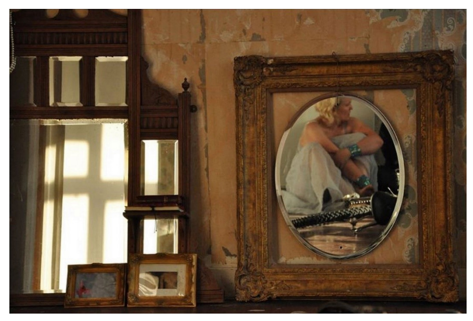
Figure 3: Cycle , photograph of performance, Shelmerdine Close, East London, UK

The two selected camera viewpoints (one situated on the dressing table and the other facing the window) as presented in the film Cycle eventually became intertwined in the editing process<sup>7</sup>. For an instant I appeared to transcend and then multiply, becoming one with the maisonette's interior, exploring existence and objects through time and space. Francesca Woodman's photographic gelatin silver prints from the House series (1975-1976) influenced the aesthetics of my project, for example through the layering of a female body, blurred by movement and long exposure (Lomas 2009). Although in Cycle the film's varying viewpoints are in colour and record the sequence of movements. On the relationship of the viewer with the actor or action in conventional film, Gravity 7 notes "the signifying production of moving image and sound would have to peel off the printed page to unravel on the cutting room floor, awaiting new modes of reconstruction and assemblage" (Chan 2007).