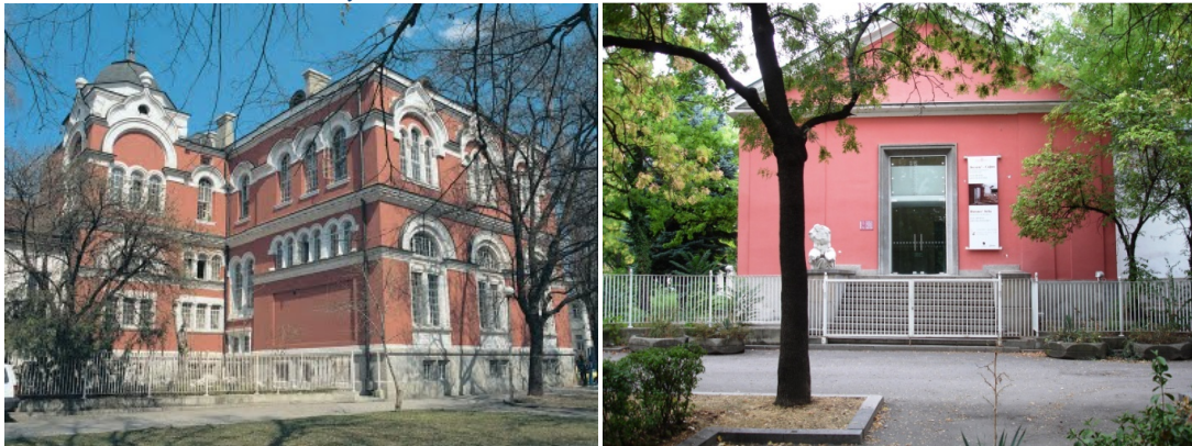
The National Academy of Art Sofia (left) and the adjoining Akademia Gallery (right).